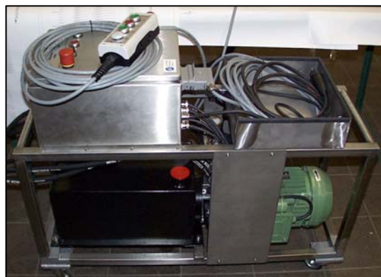
Figure: Hydraulic pump with control unit