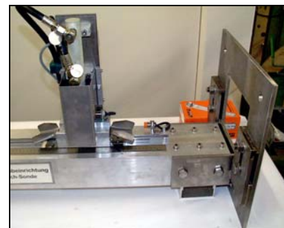
Figure: Movable thrust unit and fixing flange for borehole mouth