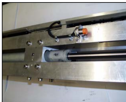
Figure: Approach switch, bearing of hydraulic cylinder