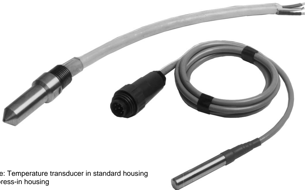
Figure: Temperature transducer in standard housing and press-in housing

For applications in an extended temperature range, a special cable is required.