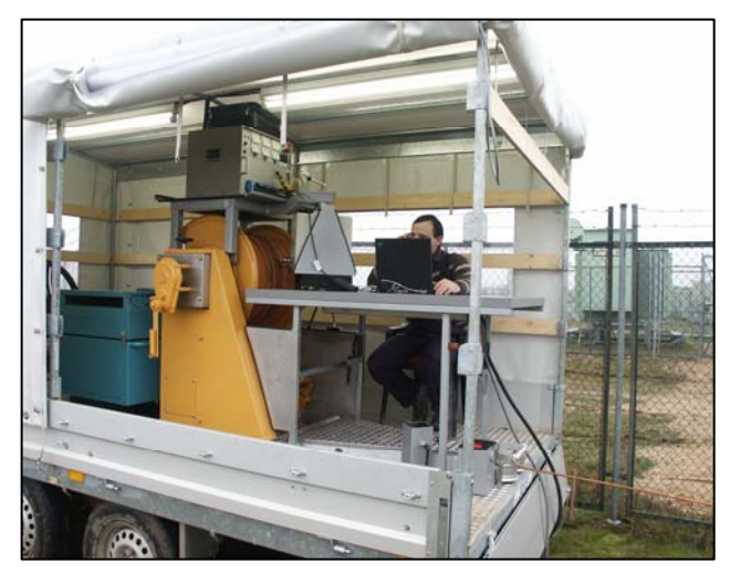
During measurement, only a control of function is necessary.