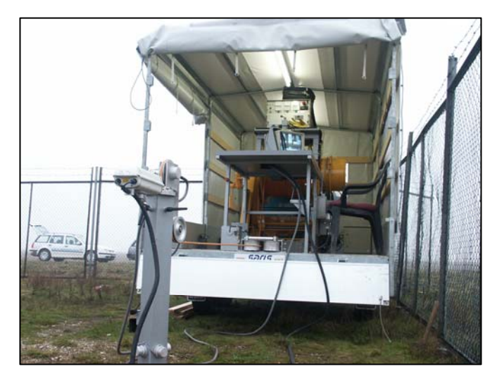
Measuring device during measurement of a 564 m deep level

At partial tube measurement, only the part of measuring level is measured which is actually of special interest. Beforehand, a measurement of level must be existing as reference measurement. The basic length for the partial tube measurement may be a subset of the basic length of reference measurement.