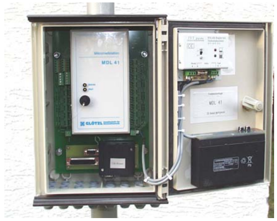
Automatic micro measuring station, type MDL41/20