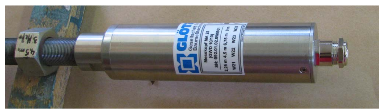
Figure 3: Measuring head with distant reading, completely mounted