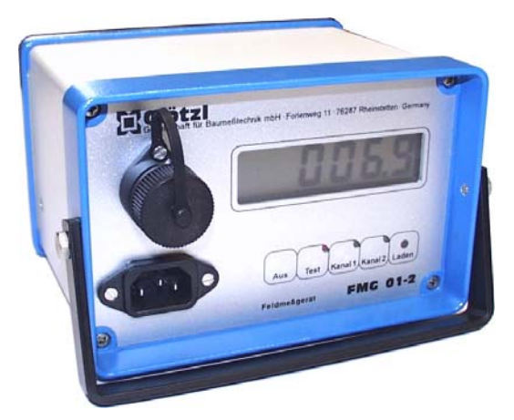
Digital indicating instrument for two measuring channels, type FMG01-2